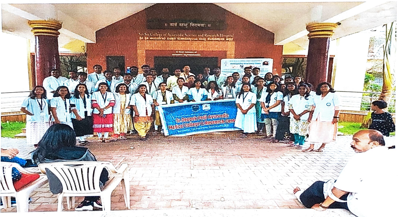
Ayurvedic Hospital visit of Sri Sri College of Ayurvedic Science and Research, Bengaluru. 30/09/2023