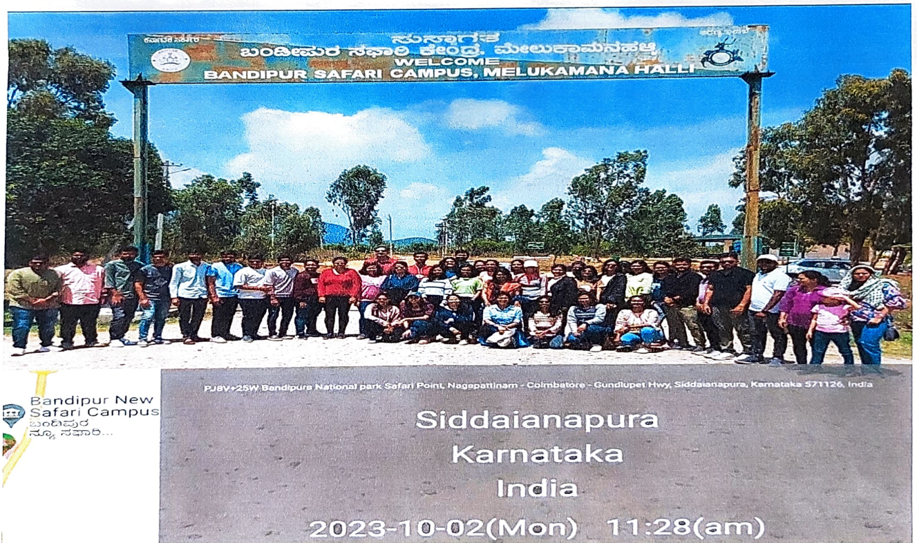
Visit to Bandipur wildlife Sanctuary and Tiger Reserve. 01/10/2023