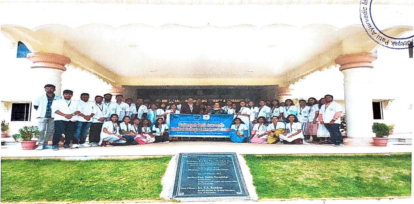
Visit to Sri Sri College of Ayurvedic science and research, Bengaluru. 30/09/2023