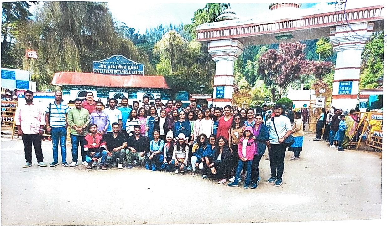
Visit to Government Botanical Garden, Ooty. 02/10/2023