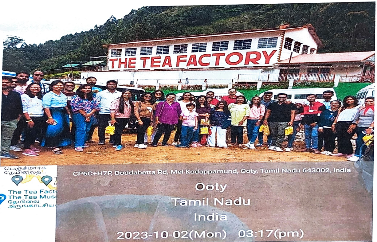
Industrial visit to Dodabeta Tea Factory Ooty. 02/10/2023