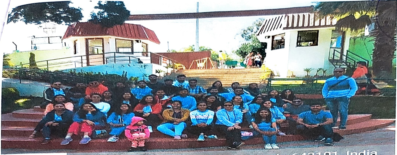
Sims park, Coonoor, Tamil Nadu 643101, India Coonoor Tamil Nadu India