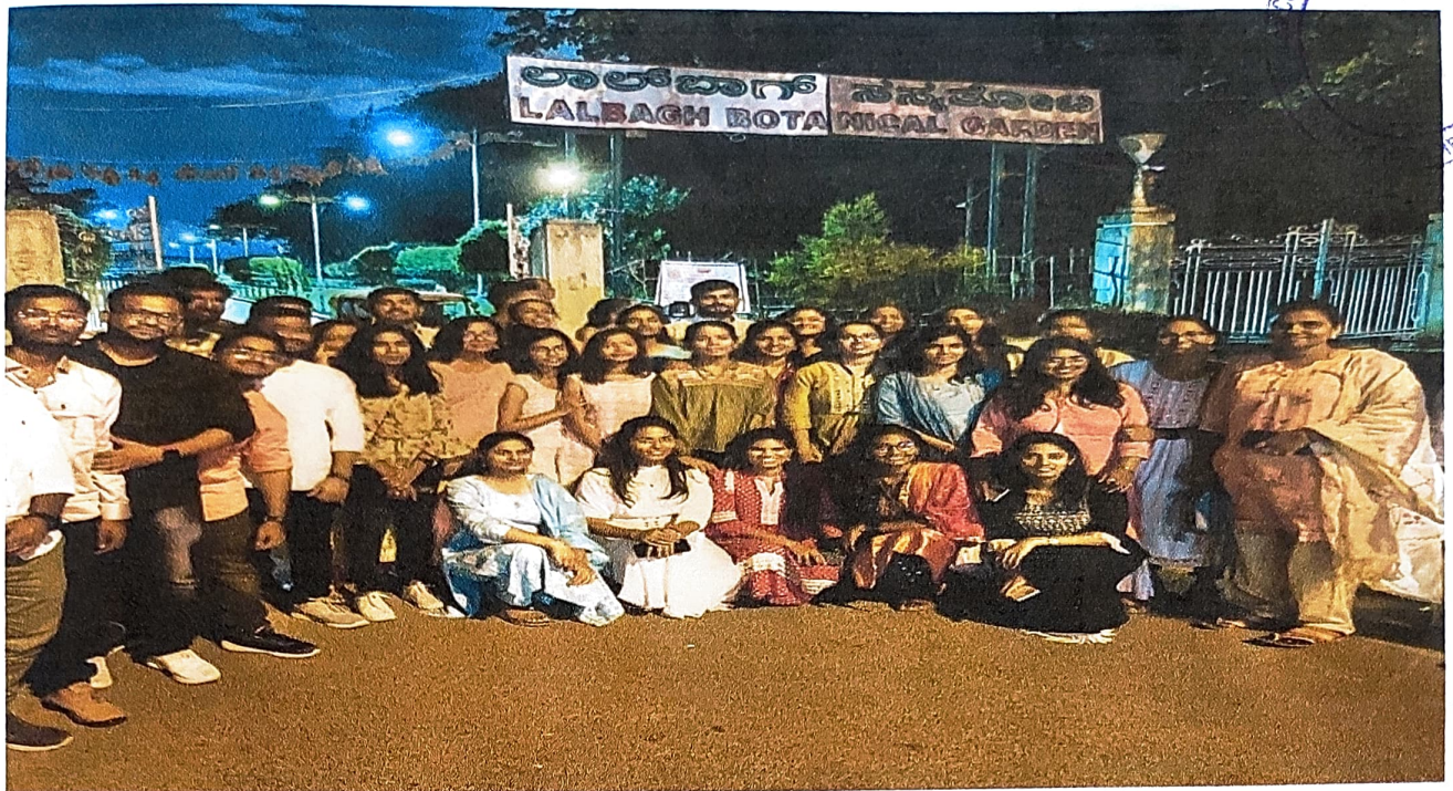
Ayurvedic Herbal Garden visit to Lalbagh Botanical Garden, Bengaluru. 30/09/2023